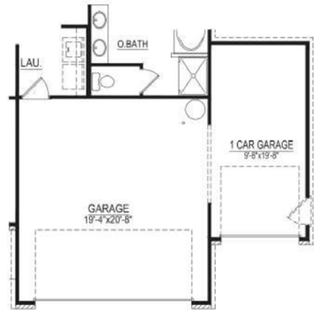
Opt. 3rd Car Garage

4 Bedrooms 2.5 Baths 1st Floor - 1,386 sq. ft. +/- 2nd Floor - 1,319 sq. ft. +/- Total Sq Ft. - 2,705 +/-