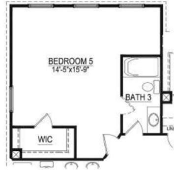
Opt. 5th Bedroom