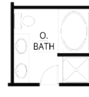
Opt. Owner Bath Upgrade