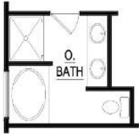
Opt. Owner Bath Upgrade